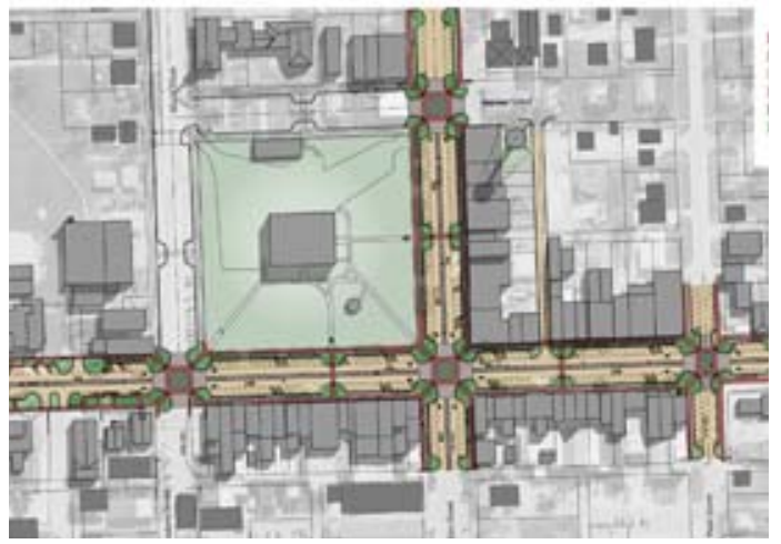
Streetscape improvements plan view