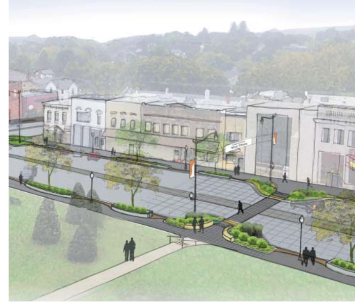
Street scape\ perspective\ from\ Courthouse

The Iowa Green Streets Pilot Project is a community -wide sustainability initiative to serve as a catalyst for further investment in the historic downtown of West Union, Iowa. The project began with a visioning workshop in October 2007 when Iowa's Department of Economic Development (IDED) completed a Technical Assistance Visit to advise West Union about the potential for multipurpose pedestrian-scale streetscape improvements. The result of the initial visioning and the subsequent Conceptual and Schematic Planning was a Streetscape Master Plan, which has led the Pilot Project, now in the construction documentation stages.